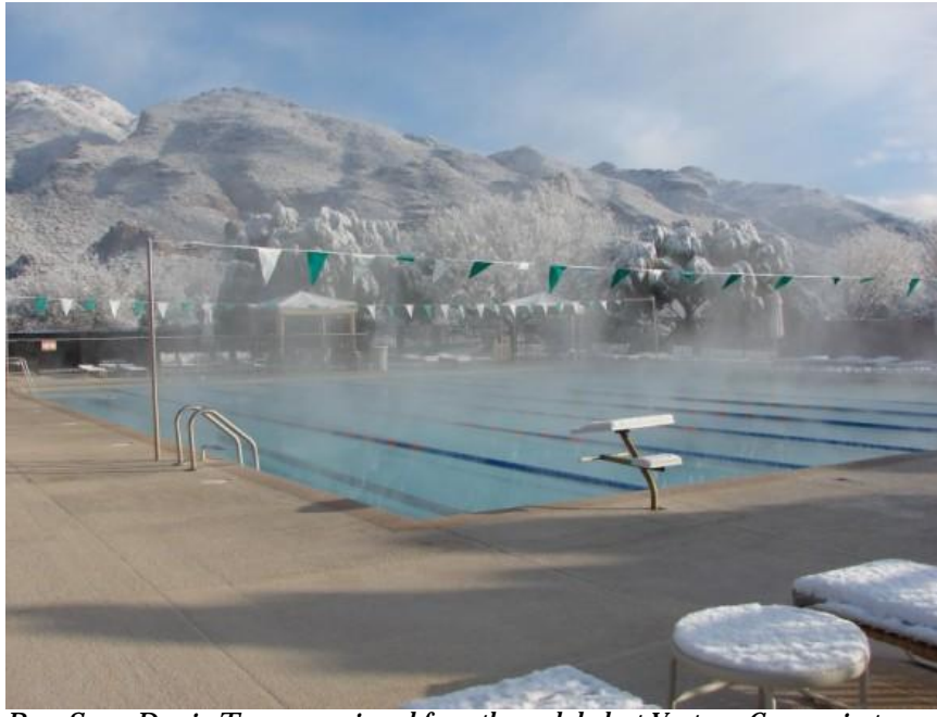
Rare Snow Day in Tucson, as viewed from the pool deck at Ventana Canyon, just one of dozens of pools around the state enjoyed year round by Arizona Masters Swimmers