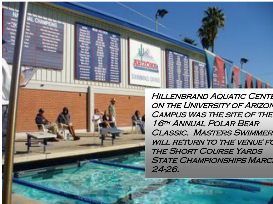
HILLENBRAND AQUATIC CENTER ON THE UNIVERSITY OF ARIZONA CAMPUS WAS THE SITE OF THE 16 TH ANNUAL POLAR BEAR CLASSIC. MASTERS SWIMMERS WILL RETURN TO THE VENUE FOR THE SHORT COURSE YARDS STATE CHAMPIONSHIPS MARCH 24-26.